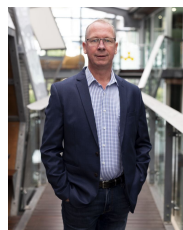
Robert Bakker 80771000

Type : Offices Price : $130,000 pa Building Size : 250 sqm Land Size : 913 sqm View : https://www.oneagencybps.com.au/8135993